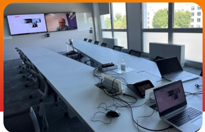
An overview of a meeting room