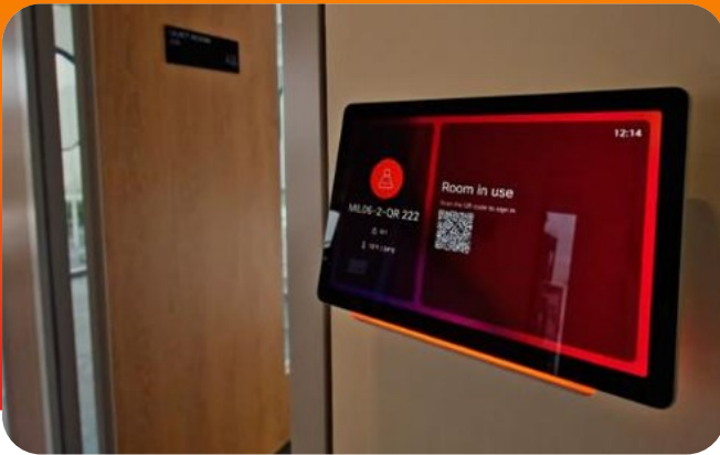
Cisco Room Kit with touch controller deployment