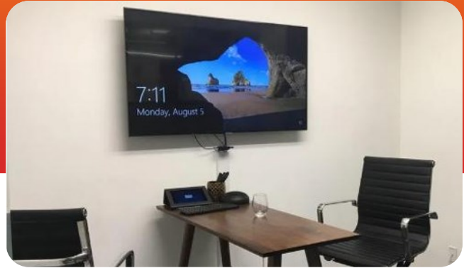
Panacast camera mounted under display