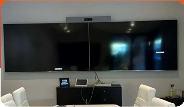
Cisco Room Kit installed in a meeting room